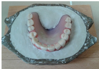
Fig. 7 Denture invested in a flask

The master cast and the waxed denture constructions were invested into a flask. The other stages have no difference with the stages of the classical technology of relining of complete dentures (Fig.7, fig. 8 -a, b, fig.9 - a, b).