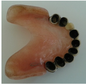
Fig. 2 Old denture constructions – connected by clasps of a partial plaque denture

In the same clinical visit we took a two-step impression using a putty-bodied (Elite HD, Zhermack) and light body material with low viscosity.