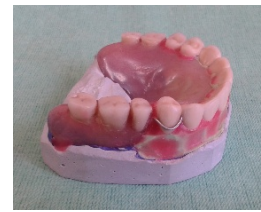
Fig. 6 c