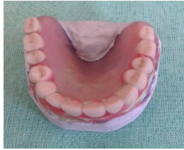
Fig. 6 a

Before the constructions and the master cast investing, we made an wax try-in to improve the transition between the MFTP bridge and the denture and to shape the ridges of the denture (Fig. 6 – a, b, c).