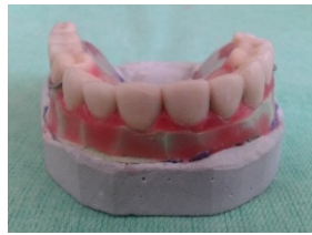
Fig. 6 b