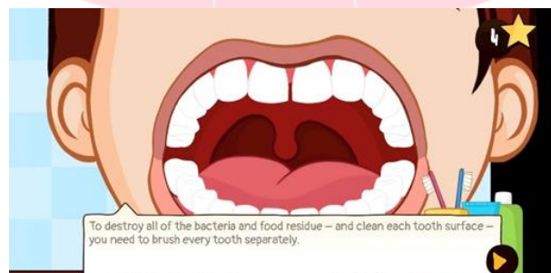
Figure 5: Tip for oral hygiene

The duration of one gameplay cycle is approximately 5 to 10 minutes, during which the child receives advice related to oral hygiene and nutrition. These tips are presented as spoken lines recorded by a voice actor, accompanied by text displayed on the screen. Each cycle of Tooth Stars includes a different set of tips, providing greater variety in order to maintain the child's interest over a longer period of time.