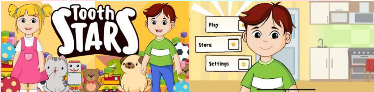
Figure 1: Home Screen and Main Menu of Tooth Stars

On the game's home screen, the child can choose a character to play with—either a boy or a girl. Then, they enter the main menu, where they must select one of three buttons: "Start Game", a virtual "Shop", or "Options".